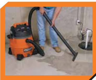
Wet Pick-up - Basements, etc.