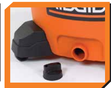
Large Drain for Emptying Water