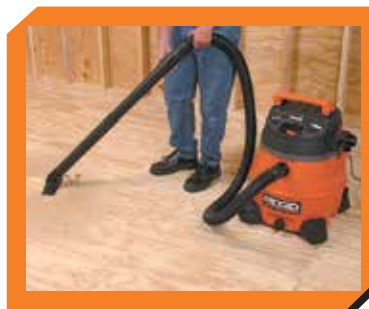
Dry Pick-up - Workshop, Garage etc.