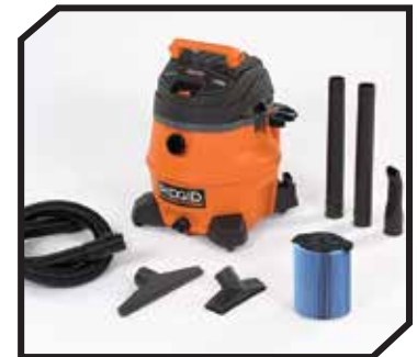
Vac with Accessories & Filter