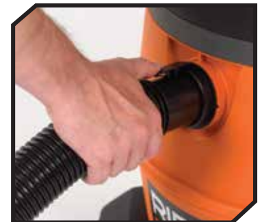
Dual-Flex™ Locking Hose